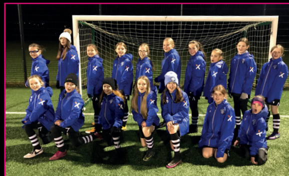
Under 11s girls football team at Westdyke Community Club

As well as a commitment to local sport, we are also supporters of The Archie Foundation, a charity that supports children and their families when they face difficult health situations. We have helped the charity to raise money towards better facilities for families within hospitals and other healthcare settings, and we are continuing to work with them as they maintain their campaign to raise two million pounds for their cause.